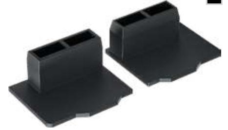
ZP 06 Yan Kasa Kapakları - Sağ/Sol Siyah/ Black Side Case Covers - Right/Left