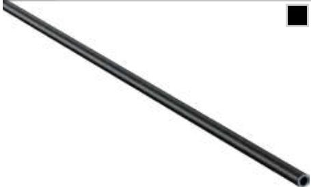
ZP 11 Perde Plastiği Siyah/ Black Curtain Plastic