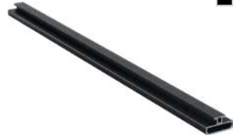
ZP 10 Kanat Contası Siyah/ Black Wing Seal