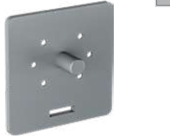
ZP 02 Çelik Pimli Motor Bağlantı Parçası Gri/ Grey Steel Pinned Motor Connection Part