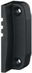
ZP 07 Kanat Kapak Siyah/ Black Wing Cover