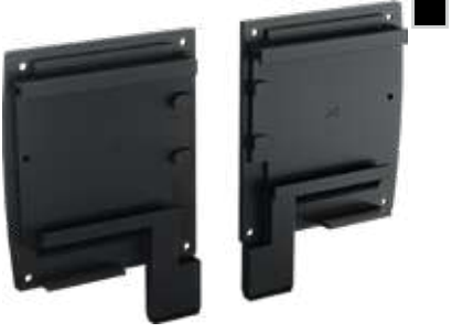
ZP 01 Üst Kasa Kapak - Sağ/Sol Siyah/ Black Upper Case Cover - Right/Left