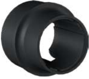
ZP 04 Motorlu Tambur Bağlantı Siyah/ Black Motorized Drum Connection