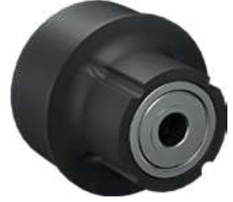
ZP 03 Rulmanlı Tambur Bağlantı Siyah/ Black Bearing Drum Connection