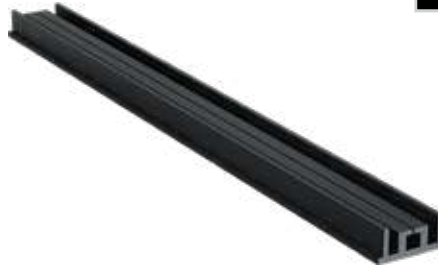
ZP 09 Fermuar Aparatı Siyah/ Black Zipper Apparatus