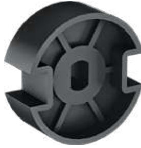
ZP 05 Rotor Aktarma Parçası Siyah/ Black Rotor Transmission Part